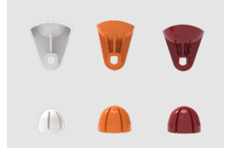
Juice extraction kits

Small (S): Grey; Medium (M): Orange; Large (L): Maroon.