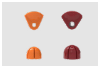
Juice extraction kits

The different-sized juice extraction kits help to maximise the yield of the juice extracted from the fruit depending on its diameter. Easily identifiable thanks to the characteristic colour of each range: Medium (M): Orange; Large (L): Maroon.