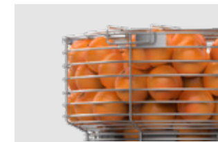
Basket in tow sizes

The machine includes a 16 kg capacity basket with lid as standard, which prevents access to the oranges. In those cases when less autonomy is required, there is an optional basket with 9 kg fruit load capacity.